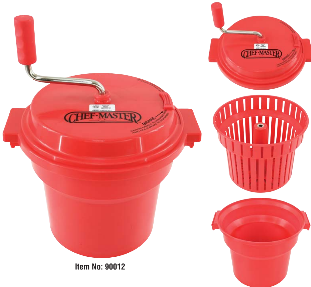
Item No: 90012