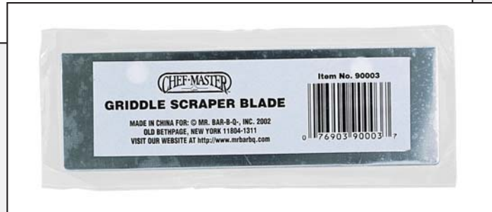
Item No: 90003