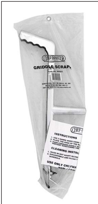
Item No: 90002