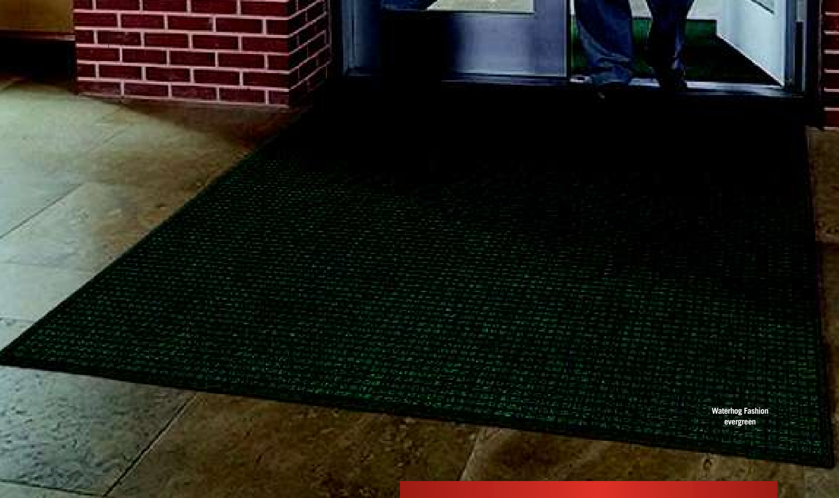
Waterhog Fashion evergreen