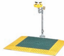
Green is for Eyewash Stations