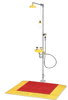
Red is for use under Emergency Showers.